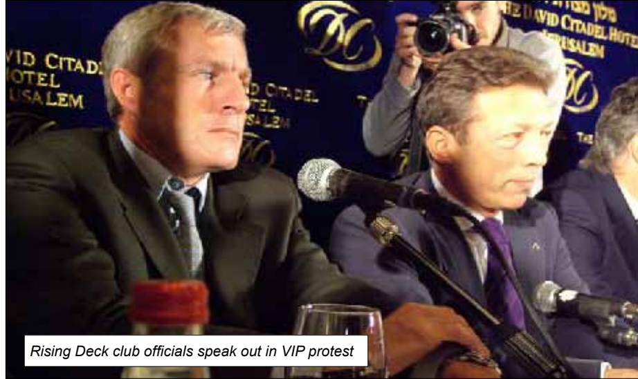
Rising Deck club officials speak out in VIP protest